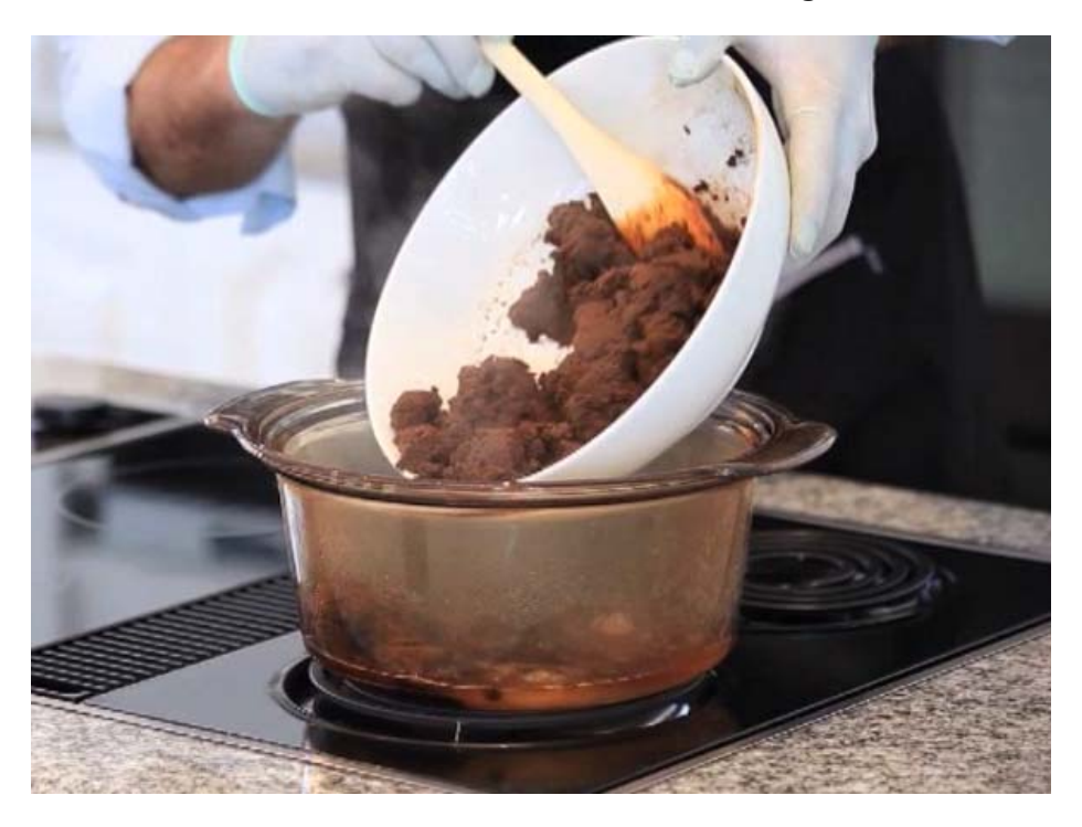
Stir continuously until ALL the lumps disappear.