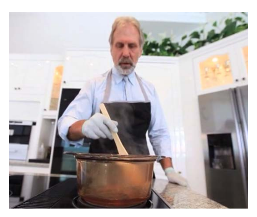
Step 4 Next add the 4 dried herbs to the simmering mixture.