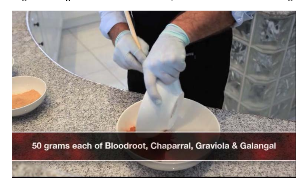
Step 1 First gather 50 grams of Bloodroot, Chaparral, Graviola and Galangal.

Then mix all ingredients into a bowl together.